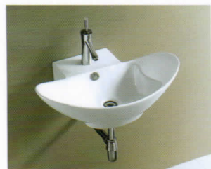
694918T 27 * 19 * 7"