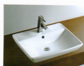
614619F 24 * 18 * 7-1/2"