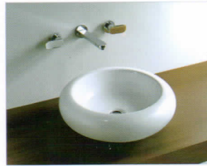
515116Y 20 * 20 * 6"