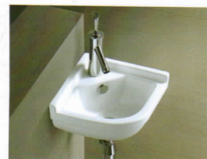
313120F 12-1/4 * 12-1/4 * 7-3/4"