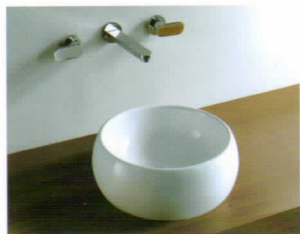
404014Y 15-3/4 * 15-3/4 * 5-1/2"