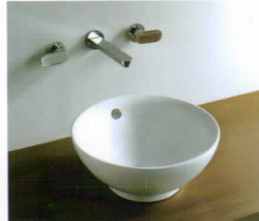
424217Y 16-1/2 * 16-1/2 * 6-1/2"