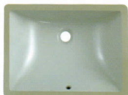
CU2014 20 x14 3/4x7 1/2