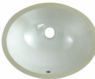
CT1714 17x14x7 3/4