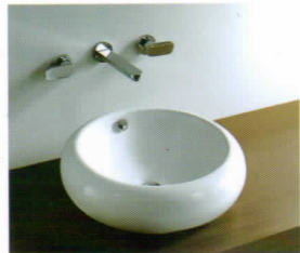
505017Y 19-3/4 * 19-3/4 * 6-1/2"