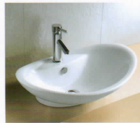
674523T 26-1/4 * 17-3/4 * 9"