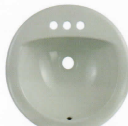
CT1919 19x19x8 1/4