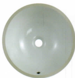
CT1717 17x17x6 3/4