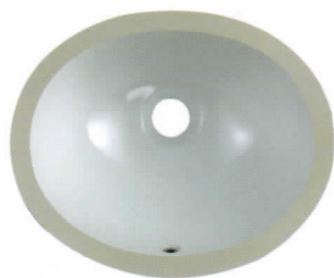
CT1512 15 x12x7 1/4