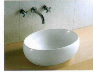
413114T 16 * 12-1/4 * 5-1/2"