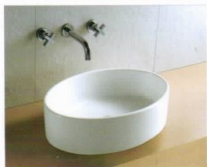
503414T 19-3/4 * 14 * 5-1/2"