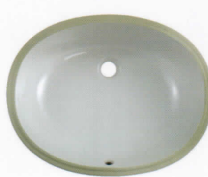
CT2216 22x16 3/4x7 1/2