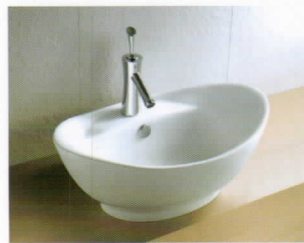
603921T 23-1/2 * 15-1/4 * 8-1/4"