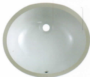
CT1916 19 1/4x15 3/4x8 1/4