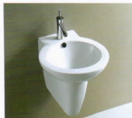
515551T 20 * 21-3/4 * 20"