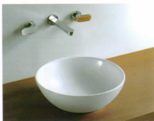
373716Y 14-1/2 * 14-1/2 * 6"