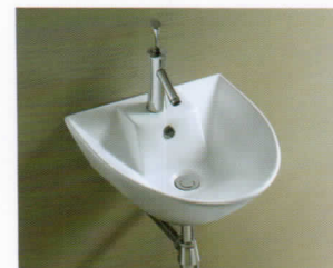
474717Y 18-1/2 * 18-1/2 * 6-1/2"