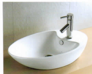
703913T 27-1/2 * 15-1/4 * 5"