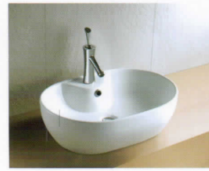
594115T 23-1/4 * 16 * 6"