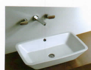
604116T 23-1/2 * 15-3/4 * 6"