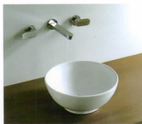
424215Y 16-1/4 * 16-1/4 * 6"