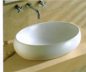
714116F 27-3/4 * 16 * 6-1/4"