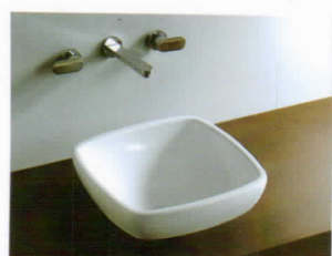
444420F 17 * 17 * 7-3/4"