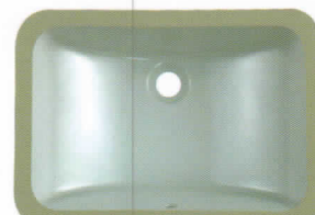
CU2416 24x16 x1/2x8 1/2